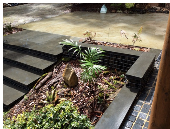
Do it Yourself Installation Using Caged Rock Gabions