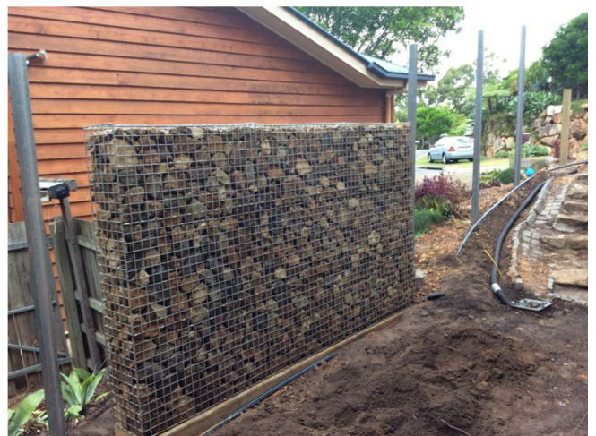
Caged Rock Gabion Fence Panel (Trachyte Rock)

Caged Rock has developed a fence panel for use where the Client requires a combination of the advantages of gabions for noise reduction, privacy and beauty. The gabions are 3m wide x 1.8m high x 300mm deep and are built around 3 x 75mm x 75mm posts which sit in concreted holes 900mm into the ground, the whole system integrity being maintained by a 150mm thick concrete reinforced connecting beam. The panels are in 600mm high sections and so one option is to produce a 1200mm high fence.