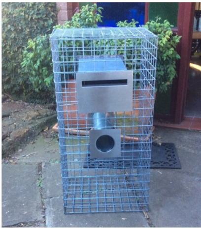
Fabricated Letterbox Gabion Ready for Rock

Caged Rock has our standard letterbox gabion in stock. This letterbox is 600mm wide x 1000mm high x 400mm deep. The gabion is assembled ready for rock installation (350kg) on site and sells for $600 plus GST ex Sumner Park. The sides drop down for easy installation of rock and dynabolting to a concrete pad, if required. The letterbox is ruggedly constructed with the letterbox tunnel fabricated in 2mm folded steel plate. Caged Rock can install the complete letterbox with rock in the Brisbane area for $900 plus GST.