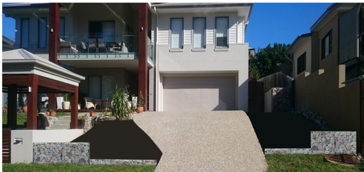
Gabion Render prepared by Caged Rock

Caged rock can assist in those difficult decisions when the gabion height, mesh size and rock colour are important in your final gabion design. We can prepare a "render" using our graphic software which will make the decision making a little easier. For a client in the western suburbs we were able to assist as to how a particular wall would look on installation. The render is shown in the attached photos where Caged Rock completed gabion walls as part of landscaping at Geoff and Marie's new house at Brookwater.