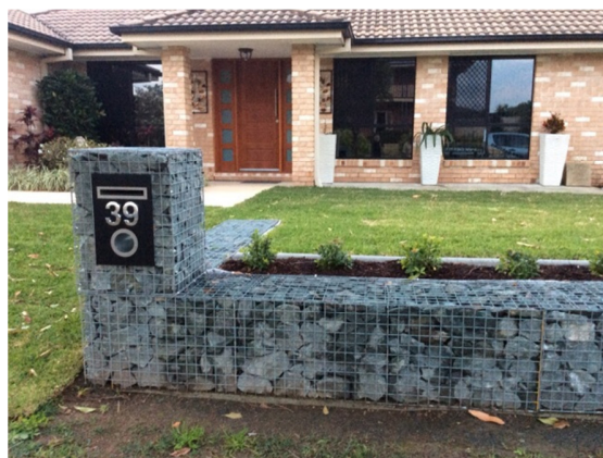
Another DIY installation using Caged Rock Gabions with Greywacke rock